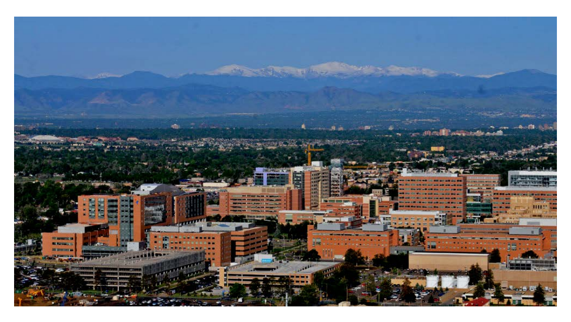
UNIVERSITY OF COLORADO SCHOOL OF MEDICINE